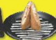
DS4 Green Tea Cheesecake $3.25 DS5 Miso Soup $1.65 DS6 Small Salad $2.65 DS7 Extra Ginger .35