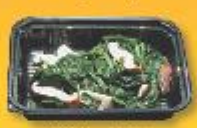
AP11 Spinach Bok Choy Sautéed with garlic, butter $25