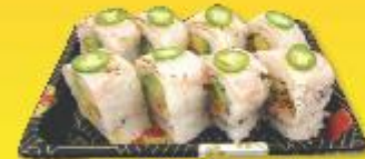
R24 Hamachi Tataro Roll Salmon, avocado, cucumber, crab, hamachi, and rice / pho style paper roll $15