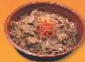
LD6 Uyu Don Sautéed beef with onions over rice 5.95