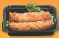
AP8 Egg Roll Crab and vegetable $25