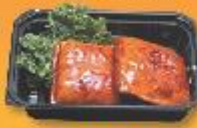
AP7 Tofu Steak With garlic soy sauce $25