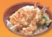
LD8 Tempura Don Shrimp and vegetable tempura over rice 6.25