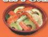
AP2 Seafood Salad With shrimp, crab, kamabiko $25