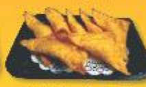
AP12 Crispy Kani Puff 7 pieces $25