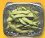
AP10 Edamame Young soybean $25