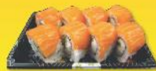
R25 In Lapelo Salmon Salmon, tempura, cucumber, lettuce, mayo $15