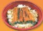
LD7 Luagi Don Barbecued over rice 5.95