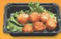
AP9 Shumai Szechuan style $25