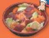
AP1 Sashimi Salad With tuna, salmon $25